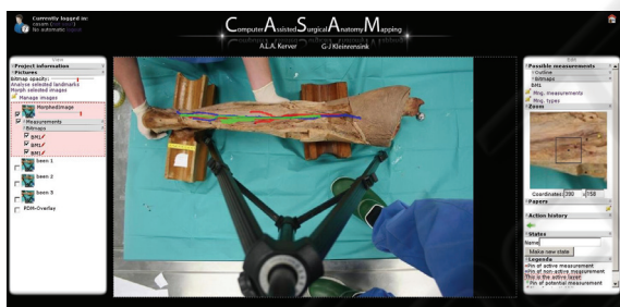
Figure 4: The web-interface work-area for researchers.

After selecting a project the main work area is shown where the user can view and edit (only when permitted) existing data or add new data (figure 4). Implemented features include: