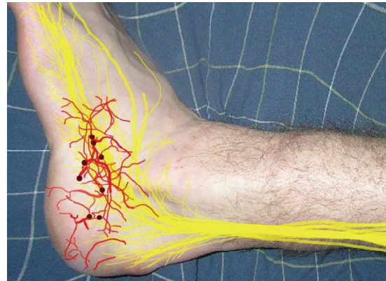
Figure 1: A patient's lateral ankle depicting the surgically relevant anatomy of ten dissected sural nerves and six posterior tibial arteries.

A simplified intuitive version of the web-application allows the surgeon to upload a picture of the ankle of his specific patient, after which he can warp the relevant anatomy (provided by the CASAM research group) over the picture of his patient (figure 1). In this way the surgeon has an easily accessible database at his disposal to optimise his pre-operative planning and determine a 'tailor made' safe zone in each patient.